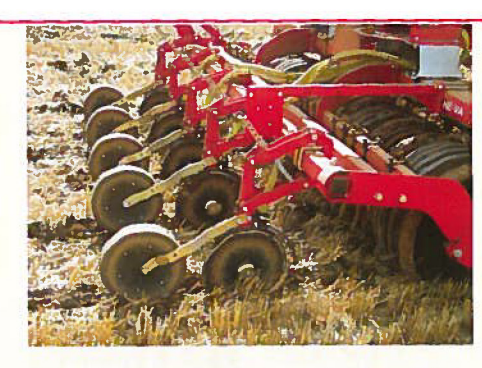
Shown here on a mounted machine, Accu-Disc units combine offset double-disc units and following press wheels.

difficult unless we improved all aspects of crop management, and establishment in particular.